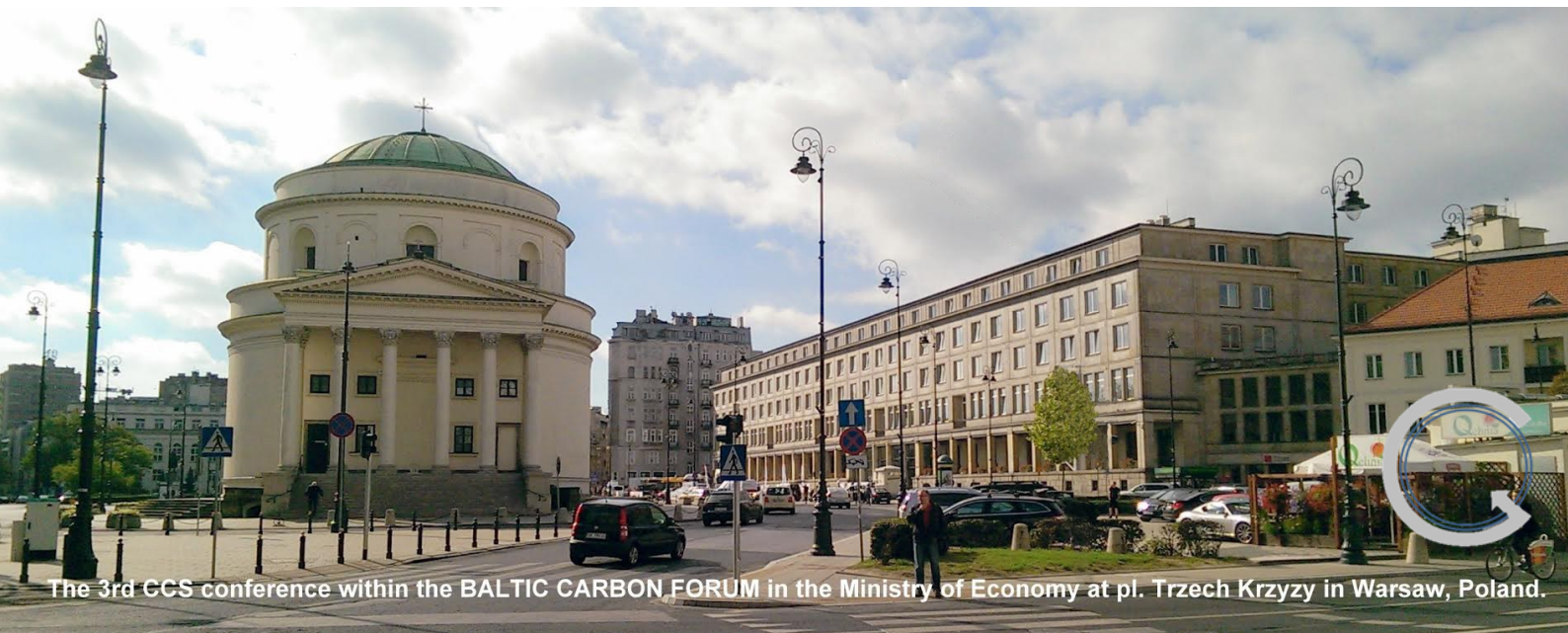
The 3rd CCS conference within the BALTIC CARBON FORUM in the Ministry of Economy at pl. Trzech Krzyży in Warsaw, Poland.