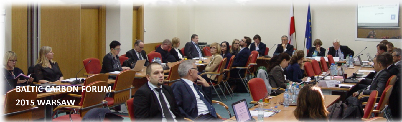
BALTIC CARBON FORUM 2015 WARSAW

Carbon Capture and Storage, CCS, is a key technology for greenhouse gas reductions. The BASREC has taken an initiative to establish a network of and for CCS expertise with the objective of supporting deployment of CCS in the Baltic Sea region. The Network also enjoys the support of the Nordic Council of Ministers.